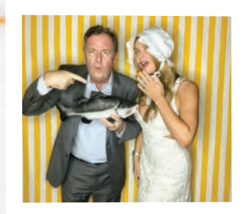
Yellow Stripe backdrop