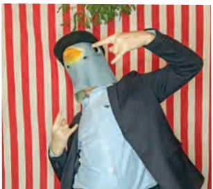
Candy Stripe backdrop