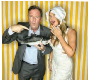
Yellow Stripe backdrop