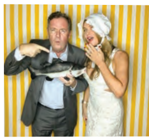
Yellow Stripe backdrop