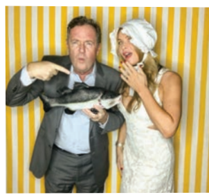
Yellow Stripe backdrop